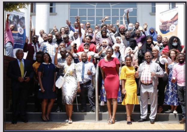
Participants in the SARLN conference © SARLN Photo/Patrick Mukabla.

The SARLN mobilises refugee-led organisations countrywide to engage in dialogue with policy and decision-makers to enable refugee leaders to guide their communities knowledgeably.