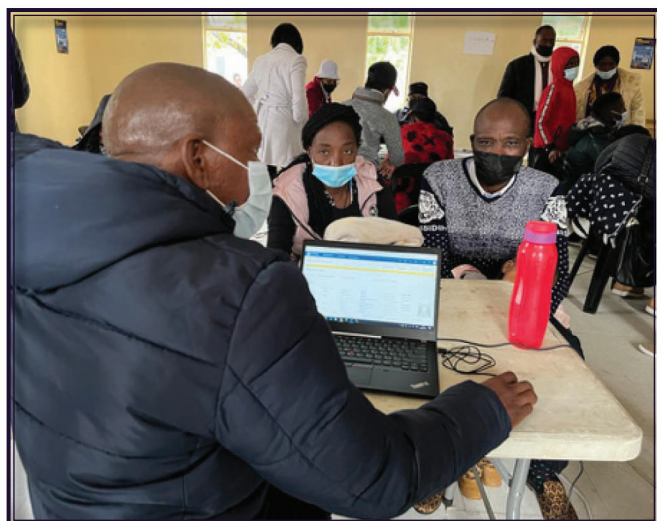
MoHA colleagues verifying information of PoC family at the Mohalalotse Reception Centre.