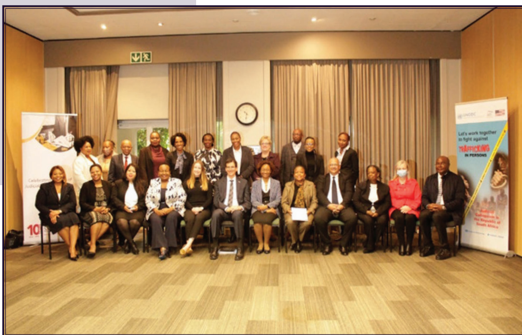
Group photo participants: Magistrates, Senior Magistrates, Regional Magistrates & dignitaries.

As part of ensuring the institutionalization of training curricula into on-going Judicial training programmes in Republic of South Africa. UNODC in collaboration with the South African Judicial Education Institute convened a Judicial Training Against Trafficking in Persons (TiP) in Johannesburg, South Africa from the 11 to 13 April, which is part of UNODC priorities in the Southern Africa Development Community (SADC) Region in enhancing the capacity of Judicial Officers in the response to human trafficking using victim centred approaches under the joint UNODC-SADC Regional Programme (2013 -2023). The objectives of the training were to strengthen capacity of Judicial officers to effectively address trafficking in persons with a special emphasis on vulnerabilities of victims and the trauma they suffer; strengthen Judicial officers' understanding of vulnerability and its role in presenting challenges to evidence and using tools that explain psychology and culture with special emphasis on child victims to resolve the evidential challenges and to build the capacity of judicial officers on Sentencing principles on anti-trafficking in persons. Lastly, the workshop also acted to launch the Trafficking in Persons Handbook for Judicial Officers in South Africa. The training workshop was attended by Magistrates, Senior Magistrates and Regional Magistrates from across South Africa. There were 35 participants; 25 F; 10 M.