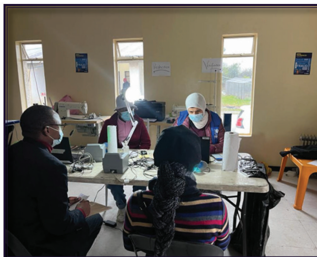
A family being registered at the "Registration Desk".