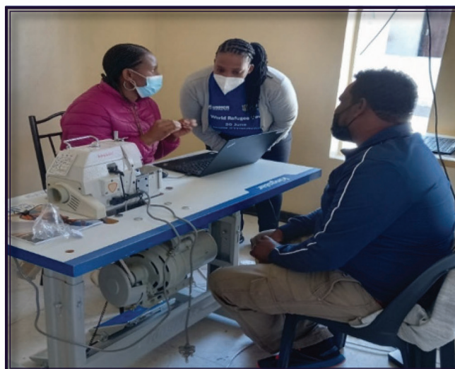
Skillshare Lesotho colleague and UNHCR staff member assisting PoC at the "Protection Desk" © UNHCR Photo|Precious Khomba.