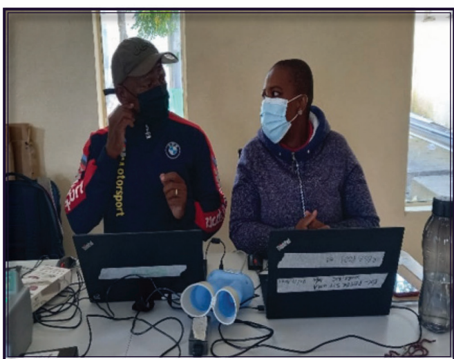
UNHCR and MoHA colleagues preparing for the arrival of PoC at the "Biometrics and Legislation" desk.