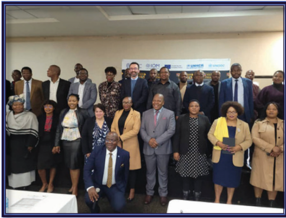
Eswatini Country-level Dialogue