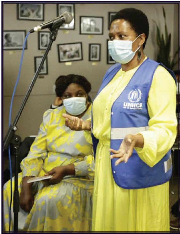
UNHCR official speaking at the SARLN conference

The first-ever South African Refugee-Led Network (SARLN) Conference was held in Pretoria, South Africa, from 22 to 25 February 2022. Titled, 'Enhancing Refugee Participation and Self-representation in South Africa,' the Conference provided refugee communities and leaders the opportunity to address gaps in refugee-led efforts (such as?).