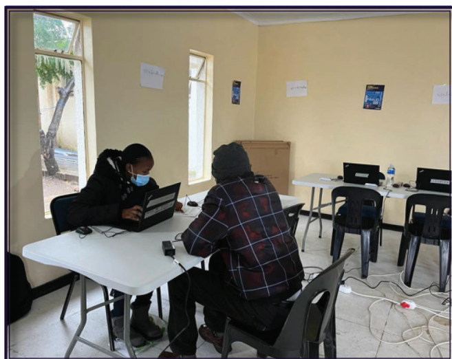
Skillshare Lesotho colleague verifying PoC .