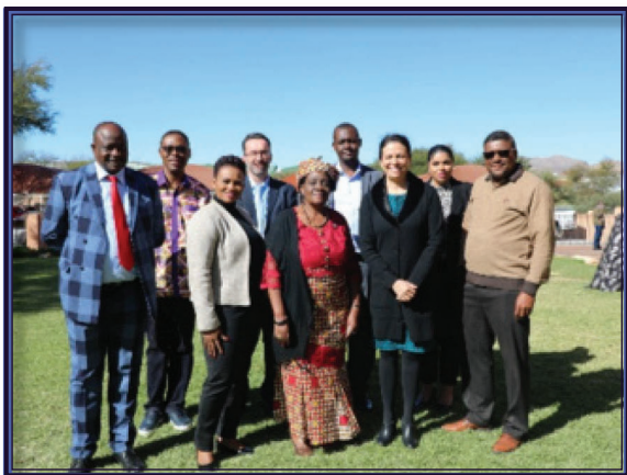
Namibia Country level dialogue