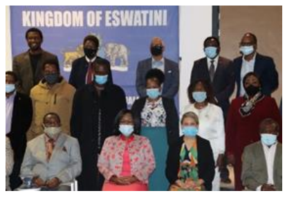
Session with members of the Parliament

On 11-12 November, the Ministry of Home Affairs and UNHCR convened an information session with the two chambers of the Parliament (the Senate and House of Assembly) and the Attorney General. The purpose of the meeting was to raise awareness about the #IBelong campaign and to advocate for the swift implementation of the EXCOM High-Level Segment pledges on gender equality in nationality legislation.