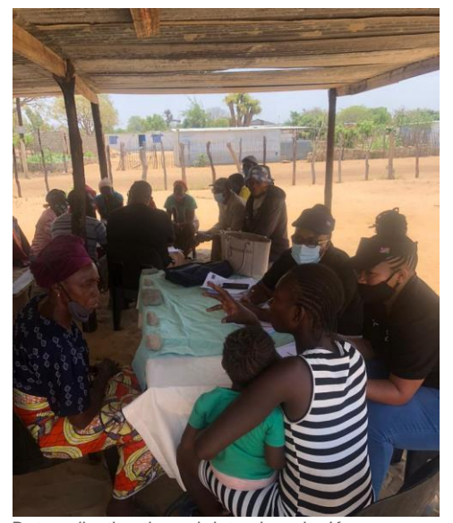
Data collection through interviews in Kavango Region of Namibia, at the border with Angola.

On 16 October, UNHCR's implementing partner in Namibia, the Legal Assistance Centre (LAC), in collaboration with the Minister of Home Affairs, Immigration, Safety and Security convened a Ministerial meeting in Windhoek on "A Study on Statelessness And Those At Risk of Being Stateless In Namibia." The meeting resulted in the commissioning of the study on statelessness to be carried out in all regions in Namibia, which builds on the pledges made by Namibia in 2019 to eradicate statelessness. The study, which is being conducted by LAC, with the support of UNHCR and the Ministry of Home Affairs, is now well underway and will be concluded in January 2021, with a final survey in the Omaheke Region, in the eastern part of Namibia. The aim of the study is to collect data on populations affected by statelessness in Namibia.