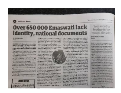
News article on statelessness published in the Swazi Observer

A training workshop took place on 13 November directed to print, radio and TV journalists. The event was of great significance, as it coincided with the celebration of the #IBelong Campaign and the anniversary of the adoption of the Eswatini National Action Plan on the Eradication of Statelessness. The workshop aimed at mustering interest and building capacity of journalists, it resulted in several articles on statelessness in Eswatini being published in local media.