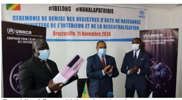
Republic of Congo birth register handover ceremony

On 11 November in Brazzaville, the UNHCR provided support for 2,000 birth certificates registers to the Ministry of Interior and Decentralization. This support follows a request from the Government which intends to issue birth certificates to people without, identified during the civil status census conducted in 2018. These birth records will be delivered to the 172 civil registration centres.