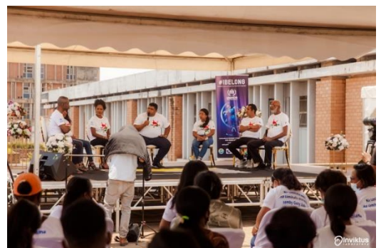
Madagascar debate on the right to nationality, featuring interventions by singer Jiaby Gasy

On 14 November, with the support of UNHCR, Focus Development Association marked the 6<sup>th</sup> anniversary of the #IBelong campaign in Madagascar, through streaming a talk show on Facebook, on the topic of "the right to nationality". The talk show, which featured the famous artist Jiaby Gasy, also a High-Level Supporter of the #Ibelong campaign in Madagascar, was able to reach over 100, 000 Internet users and generate over 10, 000 interactions.