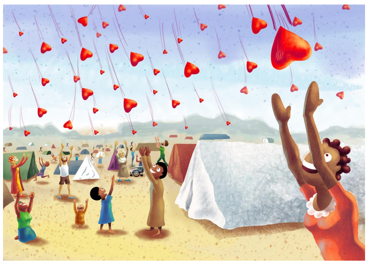
UNHCR 2020 Youth With Refugees Art Contest.

The #IBelong Campaign marked its 6<sup>th</sup> year anniversary in November. On this occasion, several activities took place in the region raising awareness about statelessness, the importance of belonging and the role of the UNHCR, governments and civil society in bringing an end to statelessness in the region