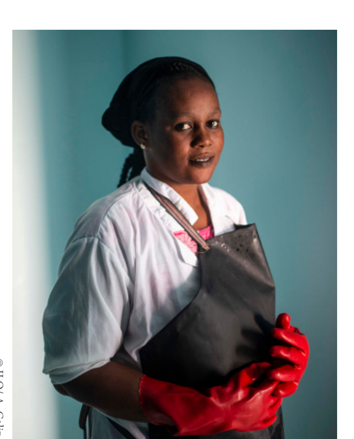
Box 1. What are bilateral labour migration agreements?

Based on the assessment methodology described below, the ILO and IOM reviewed existing challenges and practices in selected countries in Africa, and developed regionally relevant recommendations for achieving better outcomes with BLMAs.